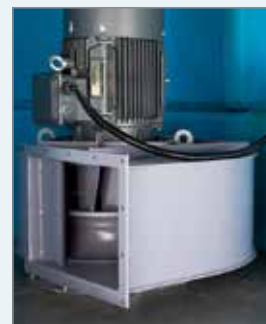
Acoustically Lined fan chamber