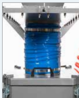
Bin Balance System