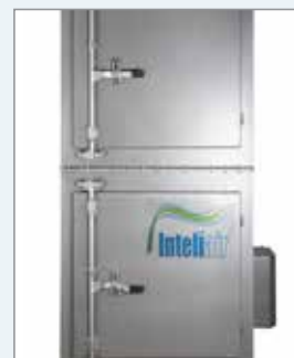
Explosion Relief Panel