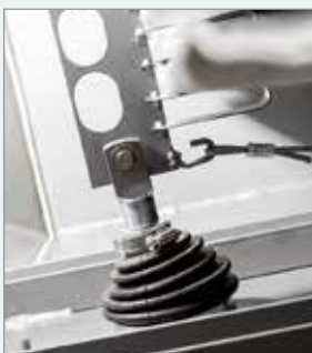
Auto Cleaning Function