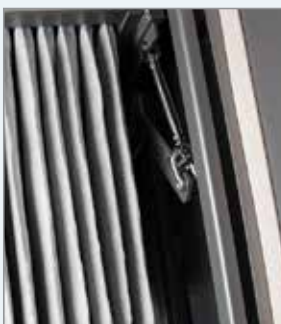
Robust Internal Cantilever