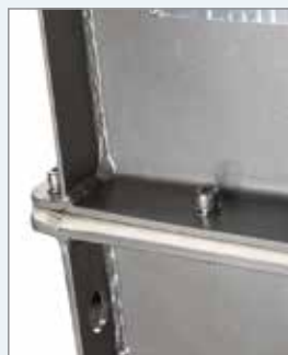
Fully Welded Construction